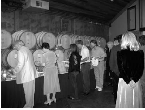
OPA members and guests dine in style at the Silver Rose Winery in Calistoga.